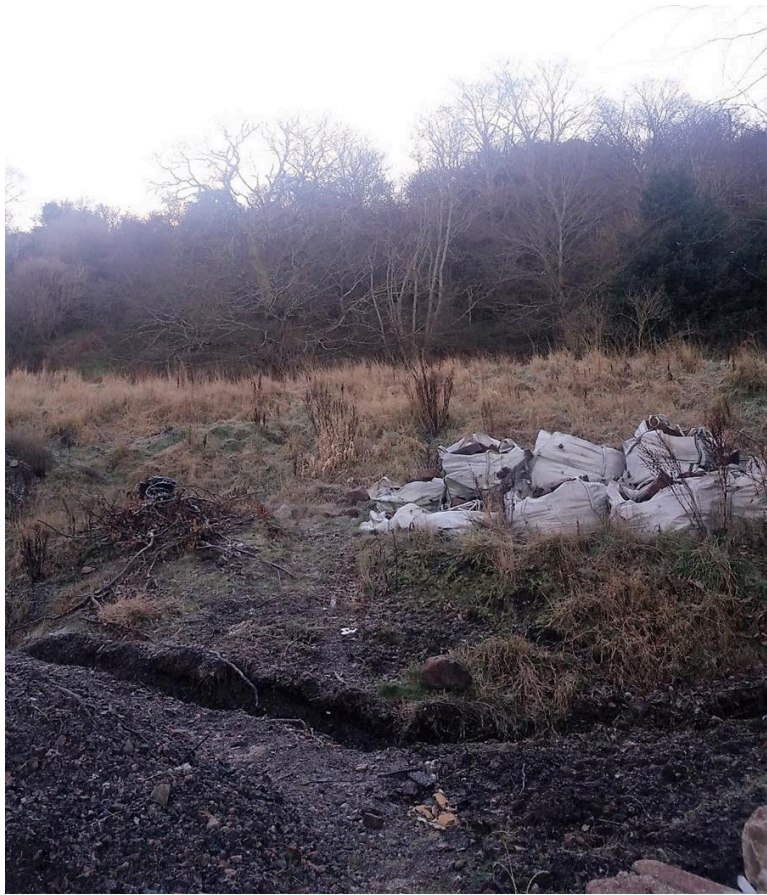
The site at Whitedykes showing how much work needs to be done.