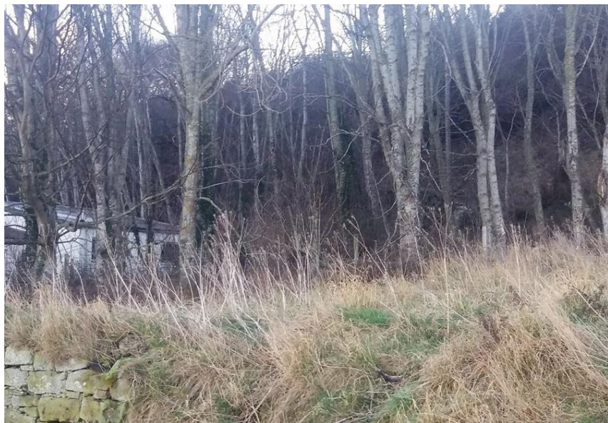
The alternative site beyond the industrial estate on the Jemimaville Road.